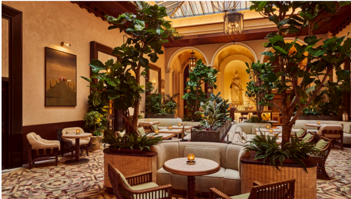
Orient Express La Minerva

So beautiful and with a light-flooded skylight: the rooms of the Orient Express La Minerva in Rome.