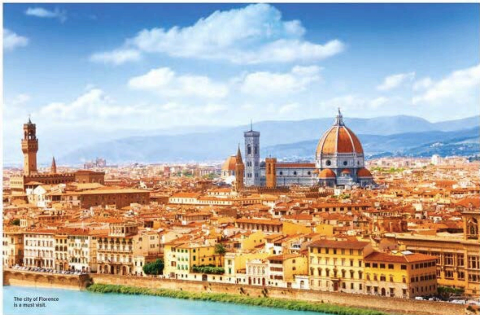
The city of Florence is a must visit.