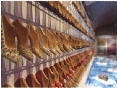
This page, clockwise from top left: A guest room at Portrait Firenze, with a view of the Ponte Vecchio; ingredients for custom fragrances at Aqua Flor; Portrait Firenze's Studio Deluxe Suite; the baron and baroness who own Castello Sonnino; How I Met Your Mother stars Neil Patrick Harris and Cobie Smulders in Florence for a Watch! photo shoot; shoes in a hallway of the Museo Ferragamo in Florence. Opposite, from top left: The top-floor terrace at Portrait Roma; gelato from Venchi; the Lungo il Tevere cultural festival; a suite at Portrait Roma.