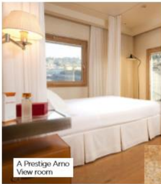
A Prestige Arno View room

Client: Hotel Continentale Date: July – August 2019