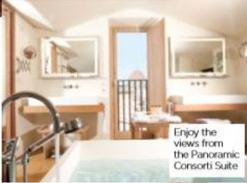
Enjoy the views from the Panoramic Consorti Suite

WORDS BY ELLIOTT WILMOT AND MOLLY FOLSHAN.