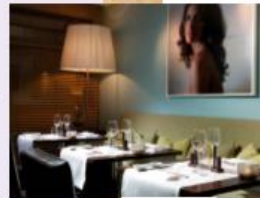
Fusion Bar & Restaurant

This hotel and magical city tick all the boxes for the perfect mini-moon: sumptuous, stylish accommodation, delicious food, history, romance and shopping. You'll leave with a love of Italian culture and be rushing to return.