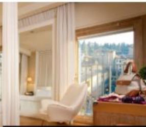
Rooftop bar La Terrazza