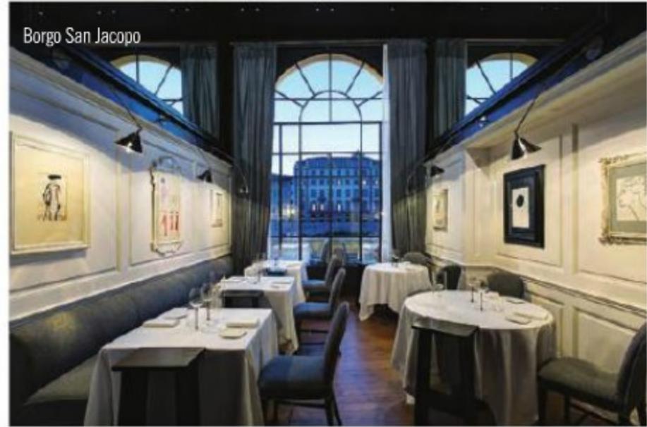
Borgo San Jacopo