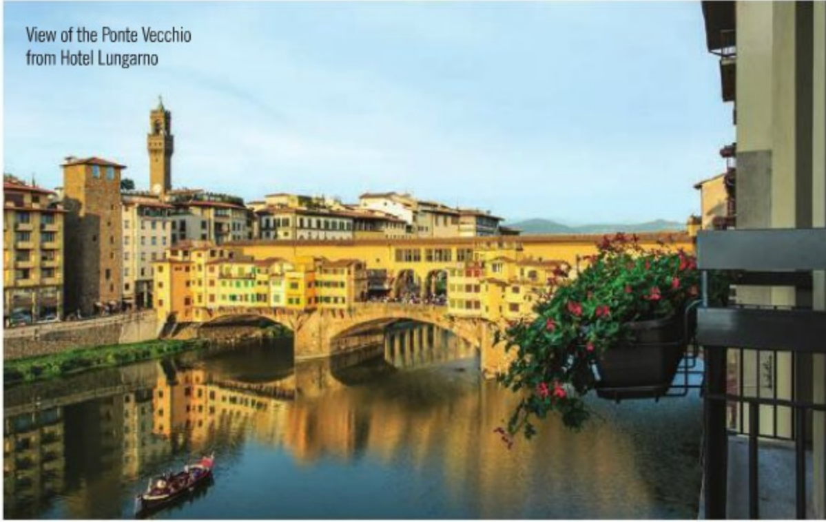
View of the Ponte Vecchio from Hotel Lungarno