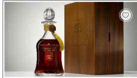
A Century in a Glass, Hermitage Siècle d'Or 100 Year Old Cognac By Chrystal Webster