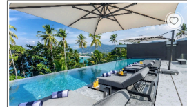
Luxury Villas in Thailand are Filling Up Fast for the Christmas Holidays - Here's Why..... By Lynsay Brown