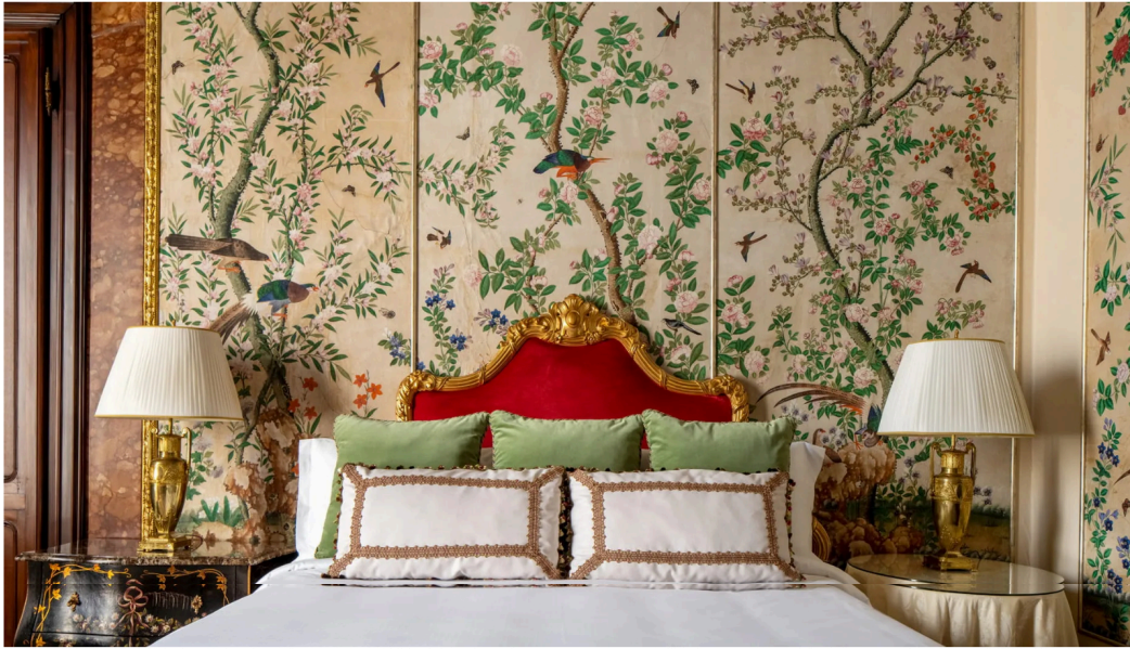
Volterrano Suite - Photo: Four Seasons Hotel Firenze